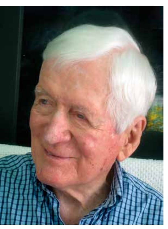
Norman , August 2010.

Norman viewed the timing to be just right because it left him free to accept the deluge of invitations to visit and speak that typically are visited upon Nobel laureates. He accepted whenever possible and never lost his enthusiasm for engaging the students who often mobbed the podium after his talks. But travel became increasingly difficult as he moved into his 90s, and he gradually slowed his pace of activities.