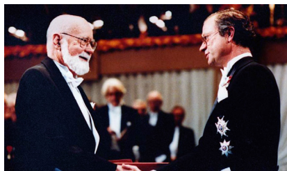
The Nobel Prize ceremony, 1990.