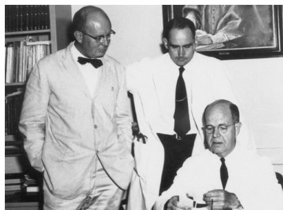
Joe Ferrebee, Don Thomas, and James Bordley (left to right) in Cooperstown, 1956.