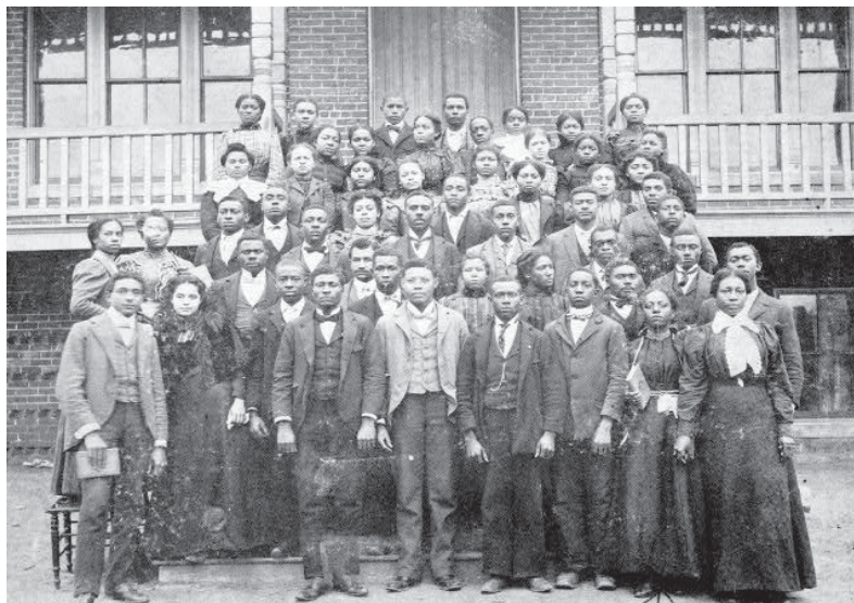
Philander Smith College students, ca. late 1800s.

Student Non-Violent Coordinating Committee (SNCC): Formed in 1960, SNCC (composed of both African-Americans and whites) student activists conducted "sit-ins" and used other methods to obtain civil rights for African-Americans. Their first attempt to organize in Arkansas occurred in 1963 and enlisted students from Philander Smith College and the Agricultural, Mechanical, and Normal (AM&N) College from Pine Bluff to hold a sit-in at public facilities (e.x.: Little Rock Woolworths) and register African-American voters in Delta towns.