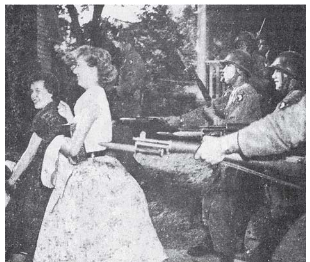
Bayonets and schoolgirls, Fall 1957.

While the federal government watched what went on in Arkansas, President Dwight D. Eisenhower assured Governor Faubus that he would uphold the U.S. Constitution “by every legal means at my command.” By late September, President Eisenhower overrode Governor Faubus by sending in the United States Army’s 101st Airborne Division from Fort Campbell, Kentucky and federalized the Arkansas National Guard. Both were now under the orders of the president. The soldiers escorted the nine African-American students into the high school on September 25, 1957. In response, Governor Faubus told Arkansans that they were living in “an occupied territory” with “unsheathed bayonets at the backs of schoolgirls.”