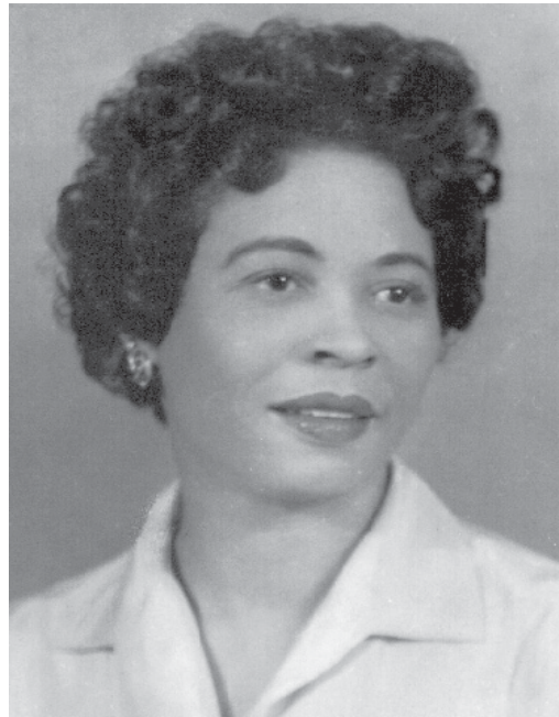
Daisy Gatson Bates.

Arkansas State Legislature: Law making body for the State of Arkansas.