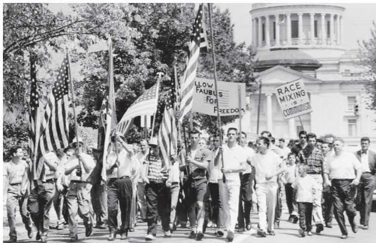
Protestors march to Little Rock Central High School from the Arkansas State Capitol in Little Rock, ca. 1959.

Another dissenting organization was CROSS (Committee to Retain Our Segregated Schools) , who used the religious imagery of their acronym in their unsuccessful appeal to Little Rock voters to keep segregationists on the Little Rock School Board in 1959.