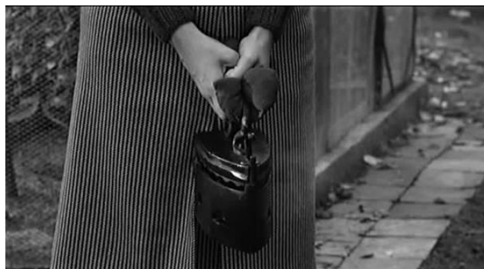
Figure 32: Elena (Lea Massari) lifts her iron in Una Vita Difficile (Risi, 1962)