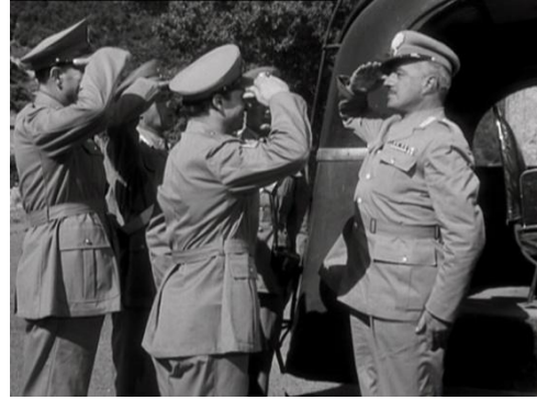
Figures 7 and 8: the peasants of Saliena engage in the most popular hobby, spying on Marshal Carotenuto (Vittorio De Sica) in Pane, Amore e Fantasia (Luigi Comencini, 1953)