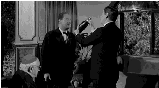
Figure 34: Silvio (Alberto Sordi) is humiliated by his employer Bracci (Claudio Gora) in Una Vita Difficile (Dino Risi, 1962)

possible in the Italy of 1961? The open-ended aspect of Risi's film in relation to these central questions it posed very much mirrors the question Ladri di Biciclette purposely renounced answering: will Antonio Ricci be able to feed his family without a bicycle in 1948 Rome? In this respect Una Vita Difficile displays the same "openness" featured in the Italian art cinema representations of the Economic Miracle, such as Antonioni's La Notte , which were always recognised to be indebted to the neorealist tradition, whereas comedy Italian style was not.