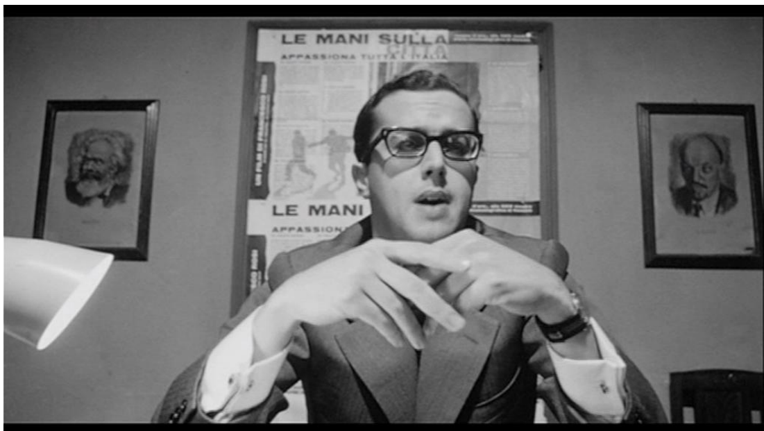
Figure 27: a P.C.I. bureaucrat channels Aristarco's view on the 'crisis' of neorealism in La Vita Agra (Carlo Lizzani, 1965)

What the filmmakers imply with this added layer of narrative inserted in their screen version is that even a determined and cultured man is inevitably assimilated by the spiral of consumerism and integrated in the Economic Miracle élite. Their alteration of the original text is thus motivated by the articulation of the social reality they represent on screen through a paradox that mirrors the post-war neorealist films with a contemporary setting.