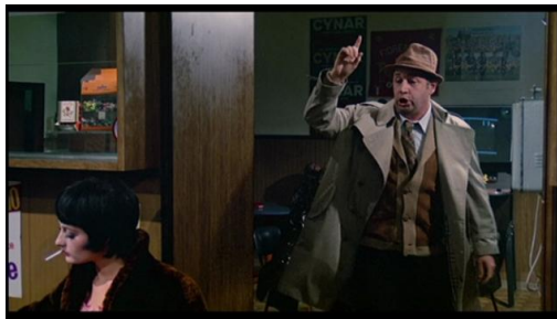
Figure 12: Perozzi (Philippe Noiret) pranks the customers of a café in Amici Miei (Mario Monicelli, 1975)

Perozzi's wife and son, who are characterised by lacking a sense of humour, are not actual antagonists in the structural sense of the term, since they never remotely manage to change the five friends' way of life. Nor are they the protagonists, since they are never redeemed by Perozzi's serenity, not even after his death. The conventional narrative structure simply does not apply to the film, no matter in which way one wants to read it. The narrative of Amici Miei is characterised, instead, by a wandering approach reminiscent of what Deleuze noted in neorealist films, as the action sprawls in spatial and chronological terms in a series of vignettes set either in present time or flashback, either in Florence or in the countryside, in which the protagonists never change, nor mature but simply confirm what we know about them since the beginning of the story. In fact, Amici Miei is so concerned with wandering that the writers had the protagonists refer to their pranks as “ zingarate ”, a neologism that the film introduced and literally means “ gypsy missions ” and openly refers to the wanderings that gypsies are associated with.