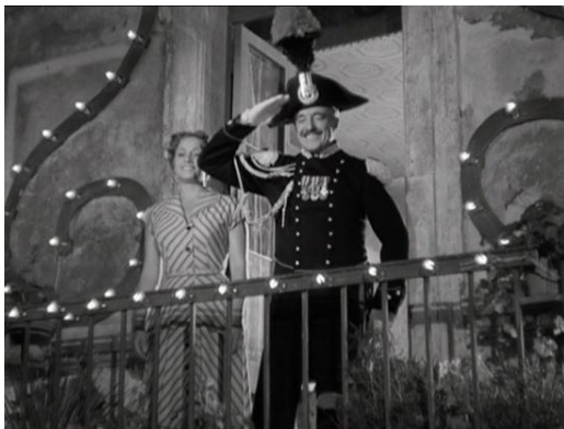
Figure 11: Marshal Carotenuto publicly declares his love for the midwife for the benefit of Saliena's gossiping citizen in the same film