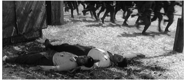
Figure 29: soldiers Jacovacci (Alberto Sordi) and Busacca (Vittorio Gassman) get the same fate in La Grande Guerra (Monicelli, 1959)