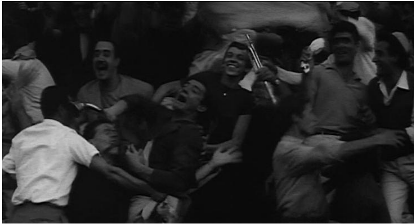
Figure 24: the man leaves his sorrows behind and enjoys a football game in the newly built Stadio Olimpico of Rome, from the same film

The impression of a parody of neorealism is seemingly confirmed by the short episode of I Mostri entitled Presa dalla Vita , in which an old lady is abducted from her home every night and taken to Cinecittà where she is filmed while repeatedly falling into a swimming pool and the title is revealed to be a pun. 42 However, in the episode entitled Scenda l'Oblio Risi and the screenwriters Age and Scarpelli refer even more openly to neorealism and implicitly clarify that, as much as they are playing with the audience's notions of the post-war neorealist practice in the