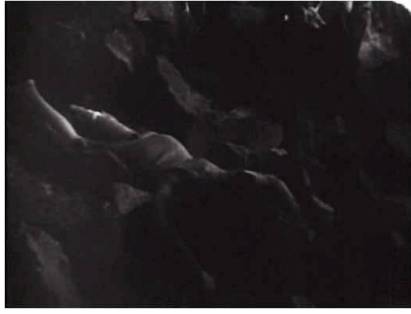
Figure 28: a girl's (Carmela Sazio) sacrifice goes unnoticed in Paisà (Rossellini, 1946)