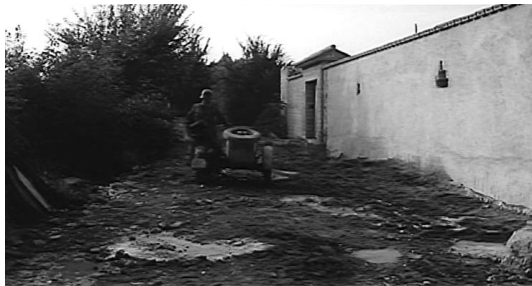
Figure 25: a German soldier drives his Motorcycle towards a villa in Scenda l'Oblío , an episode from I Mostri (Dino Risi, 1963)

replicate the patterns of post-war neorealist films with a contemporary setting: narrative solutions for overcoming the pressures of consumerist society are not offered; the 'soggetto individuale' is shown to participate in this status quo as much as society and its institutions which pressure him; the paradoxical aspects of this reality are exploited for comedic effect and are negatively characterised, as we are shown that a father's teachings are so effective that his son even kills him, that even the poor have come to put consumerist goods before the primary one and, most importantly, that even neorealist films are not shown the respect they deserve.