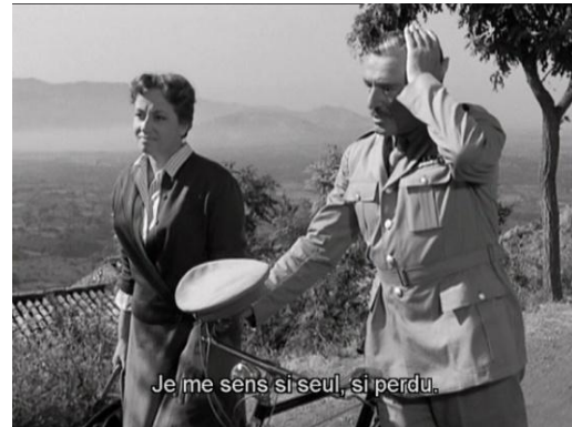
Figures 9 and 10: Marshal Carotenuto's encounters with la Bersagliera (Gina Lollobrigida) inspire him to court the village midwife (Marisa Merlini) in the same film