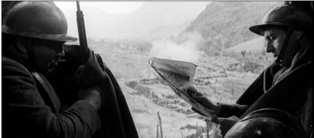
Figure 46: the soldiers at the front read a magazine article about the cease fire, from the same film