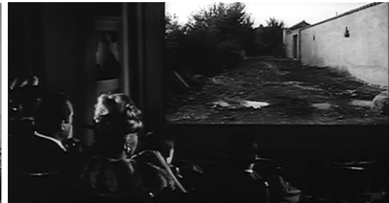
Figure 26: the war setting is revealed to be a neorealist film, seen by a middle class couple in a movie-theatre during the Economic Miracle, from the same film

La Vita Agra (1964), the film adaptation of Luciano Bianciardi's autobiographical novel of the same title, is a comedy Italian style that openly challenges the problem of the new social subject of the Economic Miracle era. The film is directed by Carlo Lizzani, who was previously a minor neorealist director, and adapted for the screen by Luciano Vincenzoni, a comedy Italian style screenwriter, with former neorealist screenwriter Sergio Amidei, thus confirming once again the strong relationship between the two cinematic forms. The plot follows Luciano Bianchi (Ugo Tognazzi), an intellectual from the small village of Castelnuovo, seeking different means of employment in Milan. At the opening of the film we learn that the actual motive that originally brings Bianchi to the capital of the North is revenge. Forty-three miners from his home village have died in an explosion