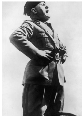
Figure 19: Benito Mussolini gives a speech in one of his iconic poses