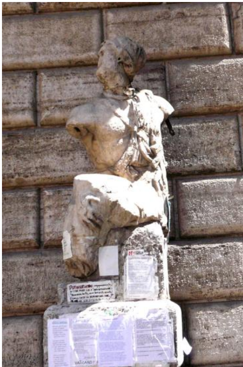
Figure 48: the statue of Pasquino in present day Rome