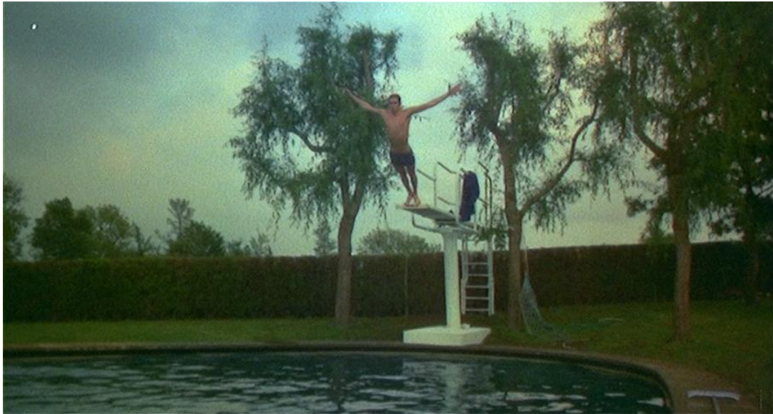
Figure 40: Gianni's (Vittorio Gassman) is freeze-framed at the start of the film C'eravamo Tanto Amati (Ettore Scola, 1974)