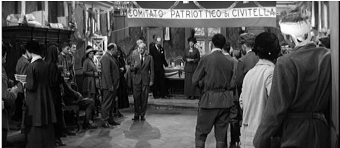
Figure 45: the regiment attends a rally in a nearby village in La Grande Guerra (Mario Monicelli, 1959)

in the Italy of the early 1960s, the historical “ filone ” of comedy Italian style (not only Monicelli’s) has indeed played a social role: that of giving to the popular urbanised masses a modern historical knowledge, and most of all that of giving them the consciousness of having been active subjects (as much as vexed ones) of Italy’s history (174). 51