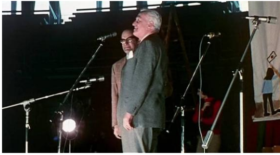
Figure 38: De Sica plays himself at a political rally in C'eravamo Tanto Amati (Ettore Scola, 1974)