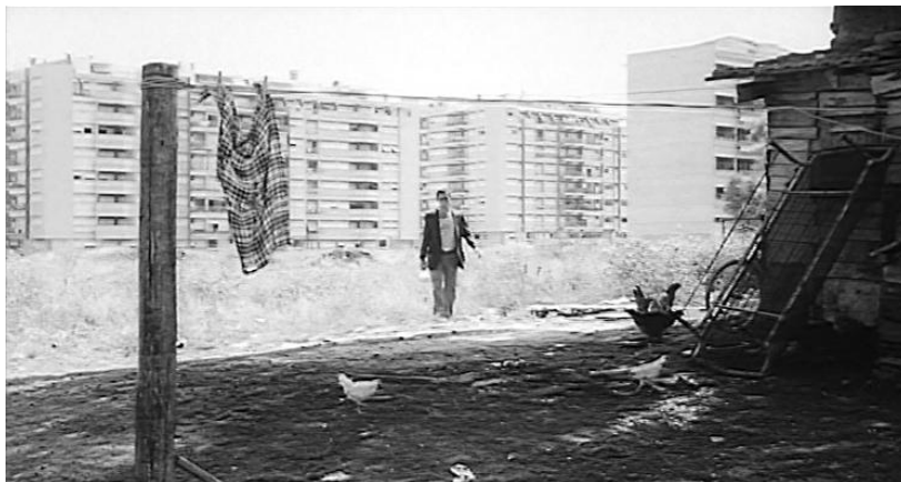
Figure 22: a poor man (Vittorio Gassman) returns to the shed in which he lives from Che Vitaccia! , the seventh episode of I Mostri (Dino Risi, 1963)

The episode alludes to the fact that the consumerist goods that the Economic Miracle offers have become a priority, coming even before the goods necessary for everyday survival. As the reference to the neorealist post-war unemployment setting implies, even the poor have been embedded in the new socio-economic order. Gassman's over-acting the part of the unfortunate poor man suggests that the filmmakers are actually parodying neorealism with Che Vitaccia! , the exaggerated accents used in this depiction of poverty being almost a caricature of a neorealist trademark. 41