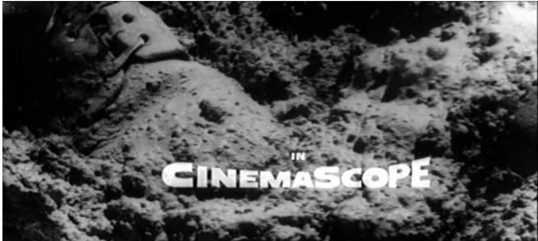
Figure 43: broken boots sink in the mud in the very first shot of La Grande Guerra (Mario Monicelli 1959)