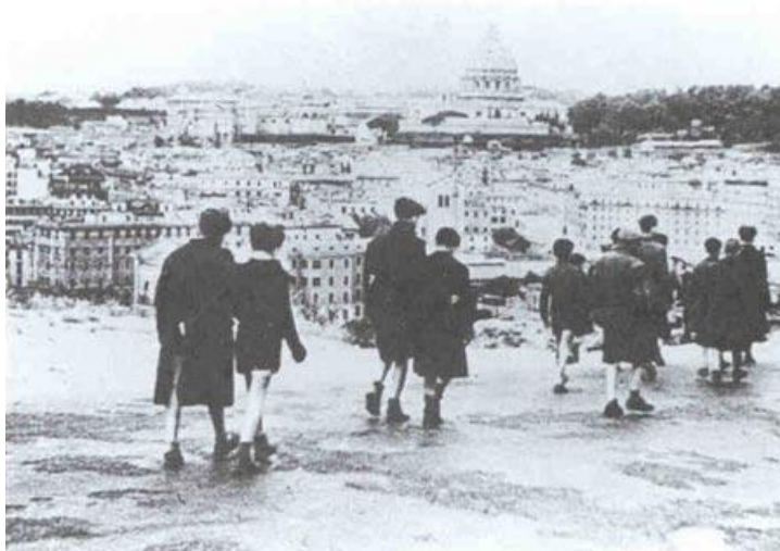
Figure 20: the children walk back towards Rome after the execution of Don Pietro in Roma Città Aperta (Roberto Rossellini 1945)

David Forgacs agrees with this point of view, pointing out that Rossellini's film "involves the working up of certain pieces of raw material into a selective myth or legend to the exclusion of other memories: those, notably, of political divisions among Italians, guilt over non-resistance, cowardice or collusion" ( Space, Rhetoric and the Divided City 109). This ethical reading of the Resistance characterised simply as a struggle between 'good' and 'evil' is confirmed in the last shot of the film, showing the group of children who witnessed the execution of Don Pietro marching back towards the city with Saint Peter's dome towering in the background. [figure 20]. Overall the neorealist films set during the Resistance express the ethical rhetoric of freedom pursued at any cost through Resistance fighting, with the Americans represented as liberators but at the same time highlighting that the communication between Italian partisans and Allied soldiers is somewhat problematic, as is the case in Rossellini's following neorealist film Paisà (1946).