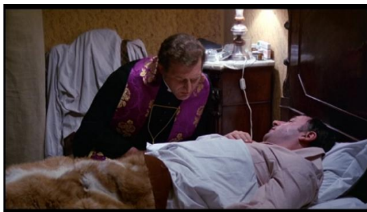
Figure 14: Perozzi pranks the priest on his death bed in Amici Miei (Mario Monicelli, 1975)