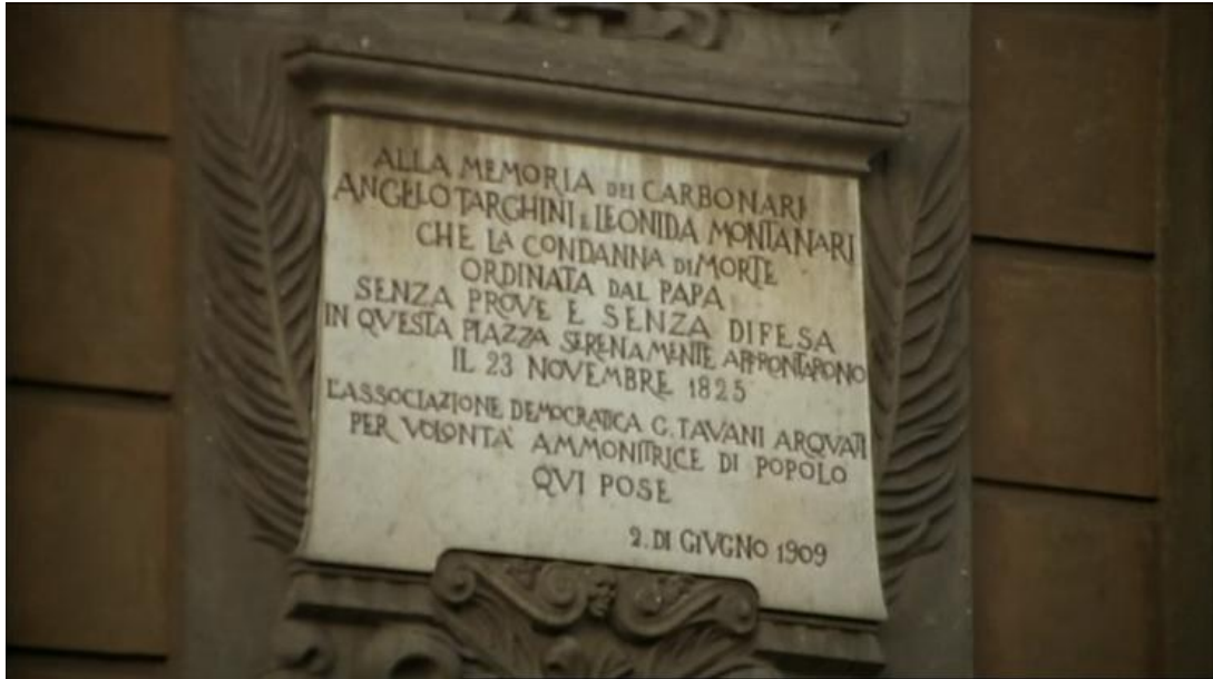
Figure 49: the plaque in the last shot of Nell'Anno del Signore (Luigi Magni, 1969)