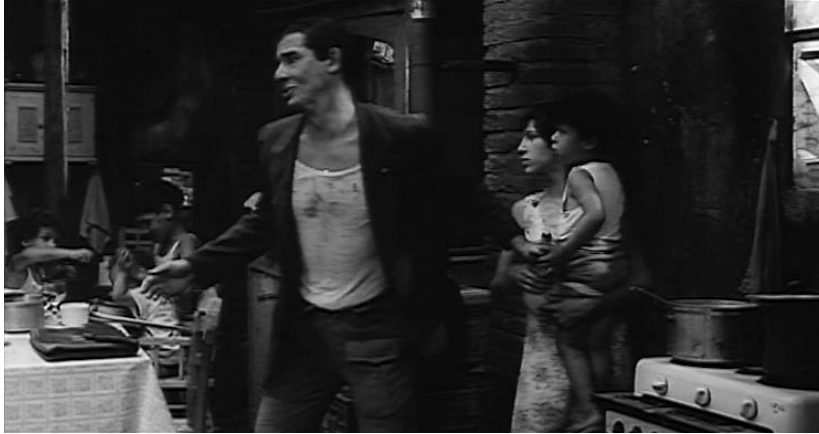
Figure 23: the man worries about his starving family, from the same film