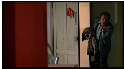
Figure 13: Lello Mascetti (Ugo Tognazzi) leaves the family house with an excuse in the same film