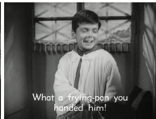
Figure 31: the altar boy reveals how the old man has been put to sleep for the benefit of the Fascist inspection, from the same film