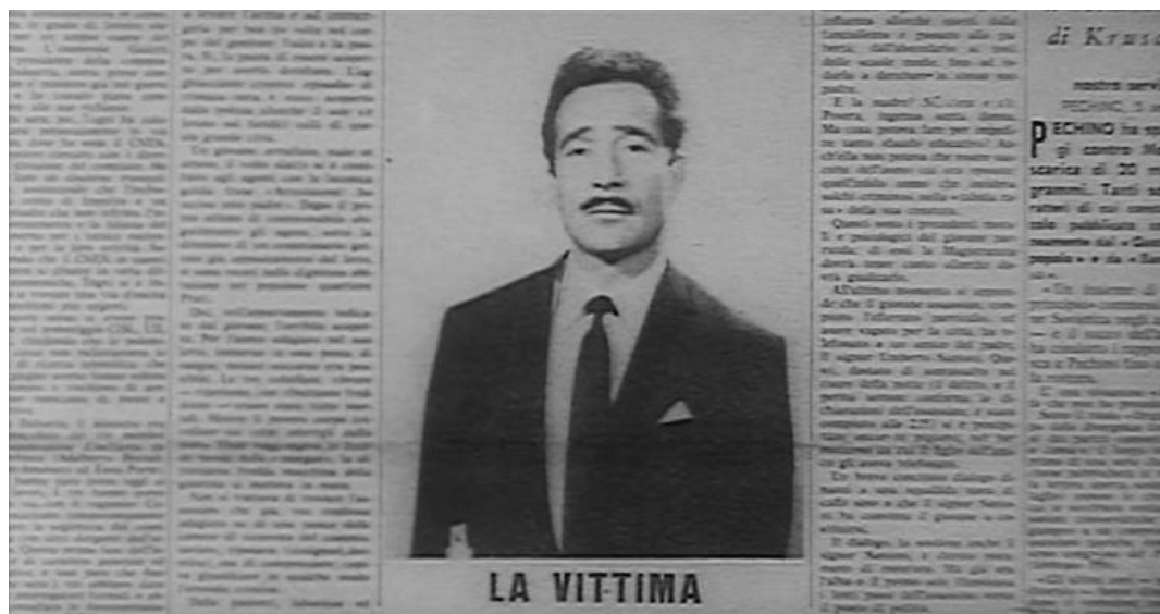
Figure 21: a newspaper story covers the murder of a father (Ugo Tognazzi) by the hand of his own son in L'educazione sentimentale , the opening episode of I Mostri (Dino Risi, 1963)

Two episodes in Risi's film refer to neorealist signature landscapes and are further indicative of the comedy Italian style filmmakers' positions towards the current socio-political landscape. In the first one, entitled Che Vitaccia! , a ragged man (Vittorio Gassman) walks towards a wooden shed that is falling apart. The high multi-storey buildings in the background confirm that the episode is set during the Economic Miracle. [figure 22] However, when the man walks in the shed, we find out that his numerous family lives in it. This setting amongst the poor reminds us of neorealist films concerning post-war unemployment. [figure 23] A doctor is examining one of the man's children, who is sick. Throughout the examination Gassman's character keeps complaining about his misfortunes and about the family's limited budget. "The milkman will not add to our tab anymore!" 38 – he explains and when he is told by the doctor that his son may need some antibiotics, he sarcastically asks his wife (Angela Portaluri): "What are we going to eat tomorrow? Medicines?" 39 However, throughout the scene, the conversation between the man and his wife foregrounds the fact that there is somewhere the man must go and that paying the doctor for the call will not leave him enough money for this non-specified journey.