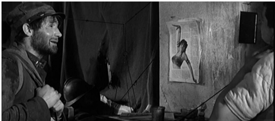
Figure 44: two soldiers from different regional backgrounds discuss the beauty of Italian silent film star Francesca Bertini, in the same film.

Whereas the soldiers' lingo reveals their regional differences through their accents, the army officers in charge command their orders in formal Italian, thus revealing an upper-class upbringing. However, when Busacca repeatedly disobeys his Sergeant's orders, the infuriated officer addresses him in Piemontese dialect. This dialectal choice signals how Gramsci's conception of the Risorgimento as a war of expansion led by the Piedmontese House of Savoy, which on the eve of the 1960s, when the film was made, was circulating due to the dissemination of the Prison Notebooks , for the first time had come to inform a comedic film. 40 The filmmakers'